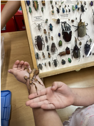
Bohart Museum of Entomology