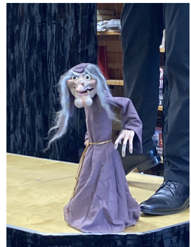
Fratello's Spooktacular Marionette Show

Be sure to keep an eye on our website for details about upcoming 2025 programs! pollockpineslibrary.org