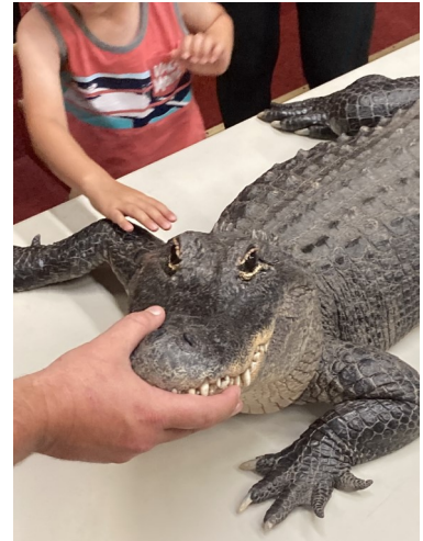
Conservation Ambassadors' Wild Things